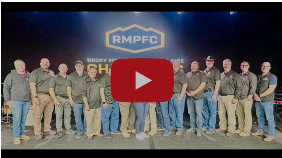
The Impact of RMPFC Chaplaincy

If you want to get caught up on on that has been going on with RMPFC, here is a link to our RMPFC News Updates . There are a lot of great things happening!