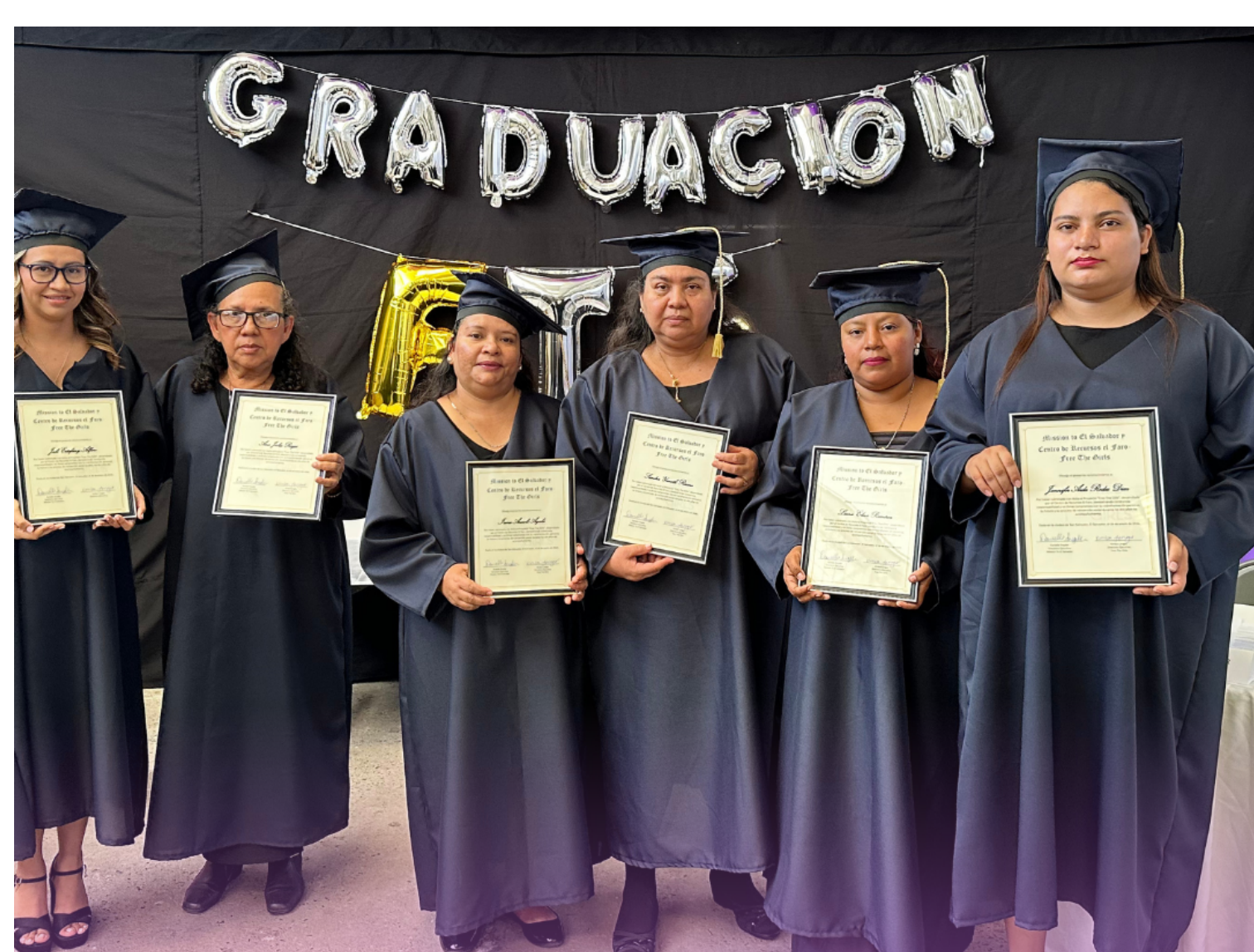
We are so excited to celebrate the graduation of these strong and resilient ladies!