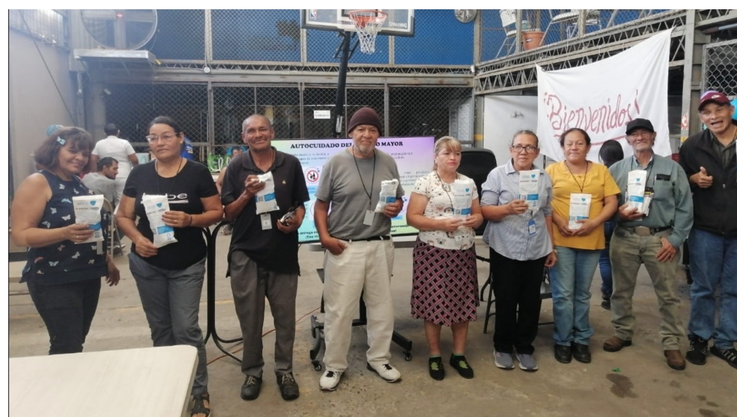
On January 15, we honored the older adults in our ministry. This age group is often abandoned on the street because of poverty and they suffer from many issues like PTSD from El Salvador's civil war in addition to other problems that their families don't have the funds to help them with. We are privileged to offer them spiritual care and other resources.

Thank you for giving in 2025! Please check your email for your digital tax-contribution statement to reflect your 2025 giving. We only mailed tax contribution statements if we did not have an email address. If you haven't received your statement, that means we didn't have your info so please contact us!