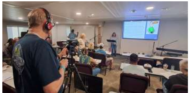
I filmed all 10 sessions, which after many impending hours of editing, will be used to train new missionary candidates.

During our biennial 4-day staff retreat in the mountains above San Diego, we completed 10 sessions on Peace-making. Conflict resolution is a critical skill for ministry longevity. I'm in my 50th year of missionary service and I've seen many schisms and have been a part of my fare share of disagreements. Only by God's grace are we still serving!