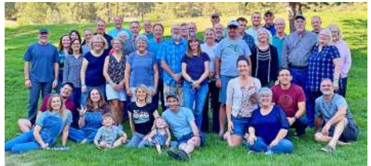
2025 Pioneers Mid-Americas staff conference

No matter which mission agency, do you know the number one reason missionaries quit and return home from the field; inability to get along with other missionaries. Yep! You see, we missionaries can be quite strong-willed and stubborn! This comes in mighty handy as we pioneer new outreach opportunities, but it also has its downsides.