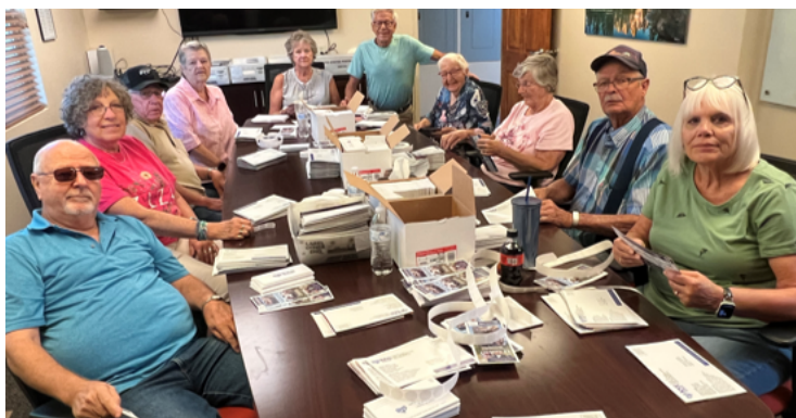
Lucky Love INC!